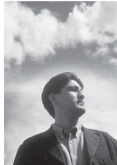
Sherman Alexie

Alexie, a Spokane/Coeur d'Alene Indian, grew up on the Spokane Indian Reservation in Wellpinit, Washington, about 50 miles northwest of Spokane.