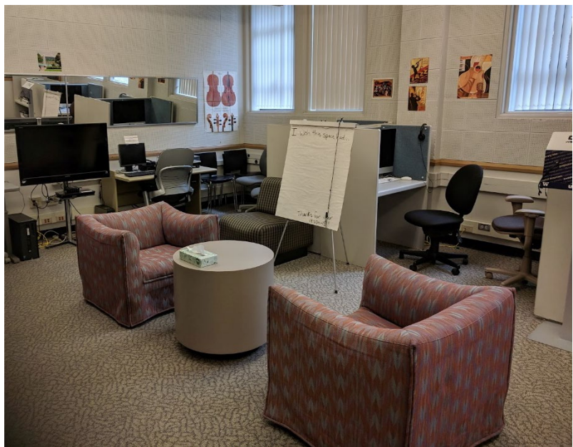
Images above show consensus among users (left) and placement for the user feedback station in the Music Listening Center.