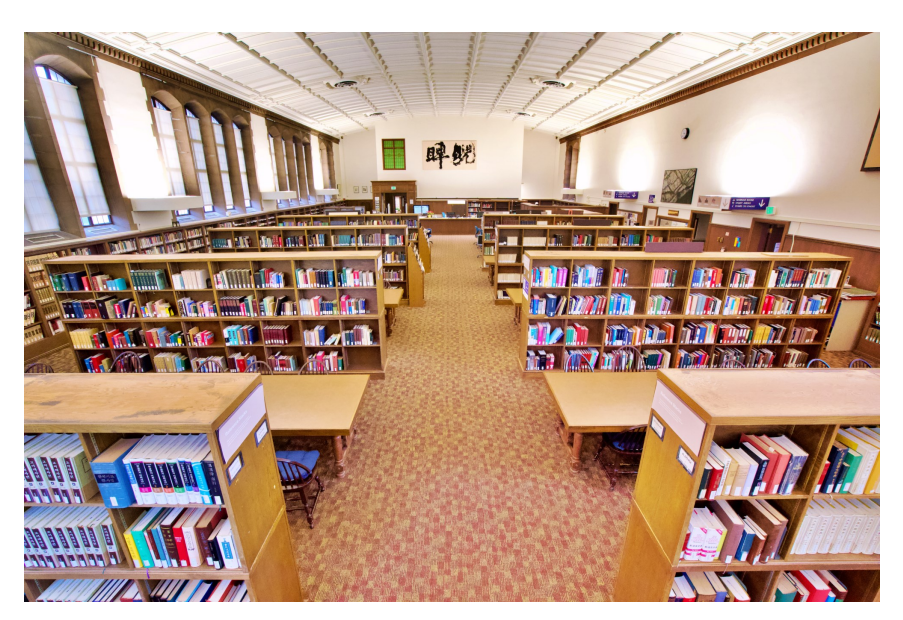
East Asia Library Beckmann Reading Room.