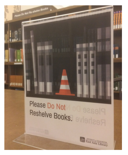
"Do not reshelve" sign, designed by Di Wang, in the Reading Room