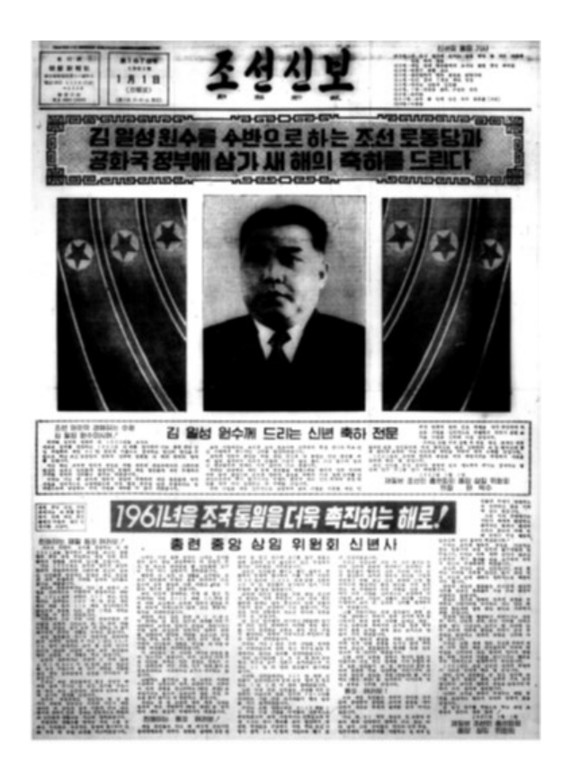
Choson Sinbo, 1961.1.1

Also included in the package we acquired are the earlier titles Minjung Sinmun (1946.01.15-1946.07.01), Uri Sinmun (1946.08.15-1946.09.01), Haebang Sinmun (1946.09.01-1956.12.29) and Choson Minbo (1957.01.01-1957.12.28). Collectively they are a wonderful resource for researching North Korean history, politics, international affairs, culture, events, and much more.