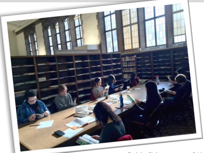
Tadoku Club meets every Friday at 2pm in the EAL reading room

opportunity to improve their Japanese reading skills using these short and easy stories, and reading together with the group of other friendly students helps keep motivation high.