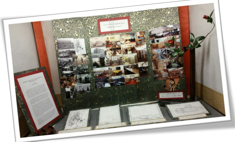
The main exhibit display, featuring historical photos, maps, and architectural drawings from the East Asia Library's 80-year history. More displays can be found just inside the EAL entrance.

The Buildings and Architecture exhibit will run through spring quarter, 2017, with the next exhibit to be installed in the summer. Check it out in the exhibit cases just inside and outside the library, on Gowen Hall 3rd floor!