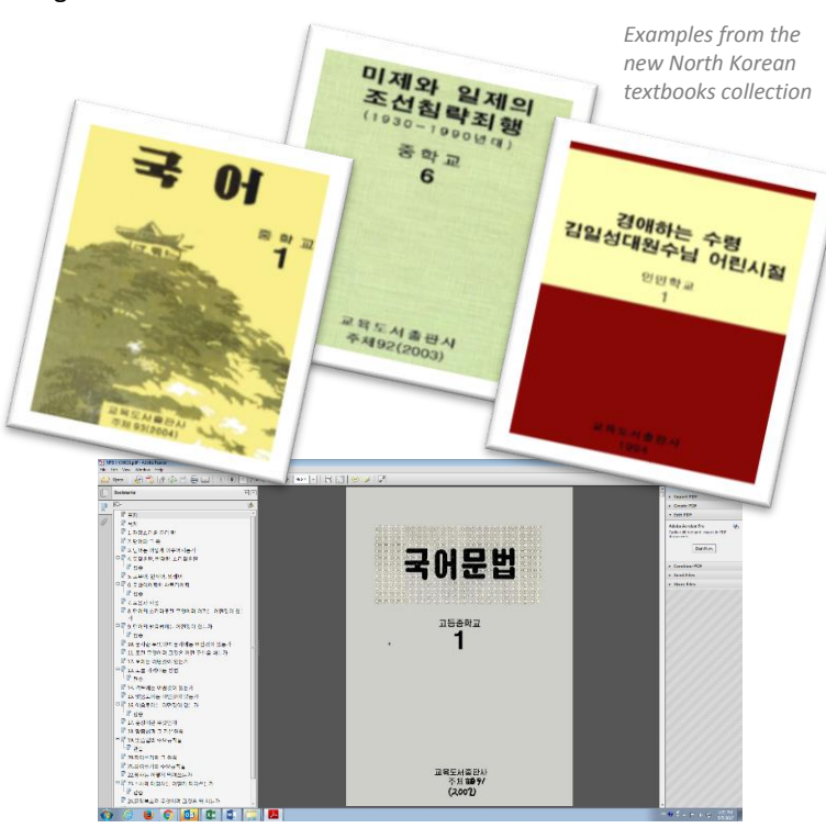
Viewing a textbook PDF

The textbooks should prove valuable for research on the North Korean education system and school curricula as they cover not only arts and sciences subjects but also "special education" subjects such as revolutionary history, socialist morality, and great leaders.