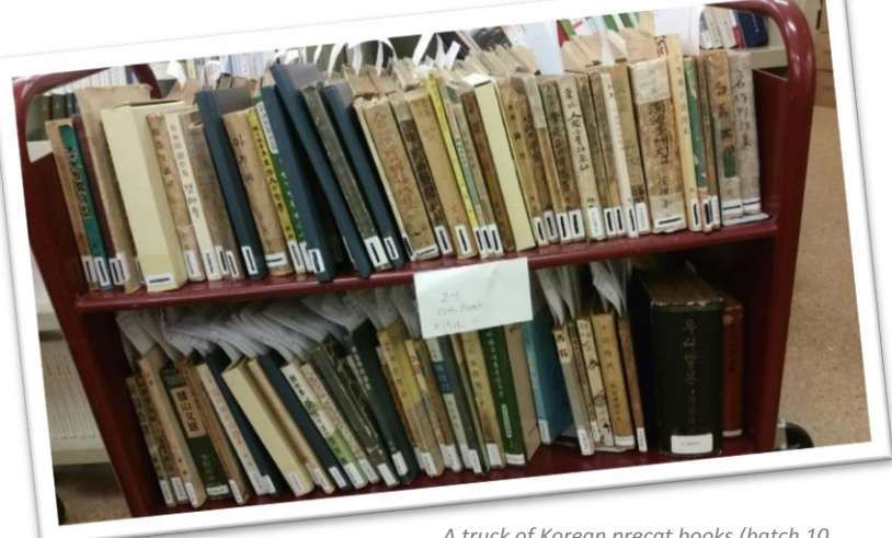
A truck of Korean precat books (batch 10 and batch 13) awaiting processing

After this initial phase, we continued the project using the TLS outsourcing company, starting in the fall of 2016. A Korean student specialist was hired to do preparation work for the outsourcing, such as scanning certain pages of the Korean precat books. After each batch of titles is cataloged by the outsourcing company, she also works on post-processing work—copy cataloging the titles into our library's local system. Through this outsourcing process, we have been able to add an additional 684 unique titles to our collection as well as to WorldCat (a global, cooperative catalog of library collections), from the first batch of records in October 2016 through May 2017.