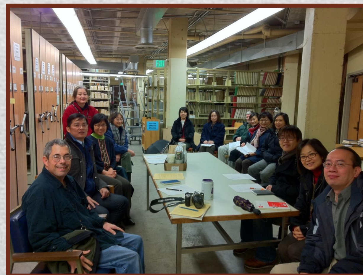
The first staff meeting that took place in EAL Auxiliary after a major shifting of materials in 2010