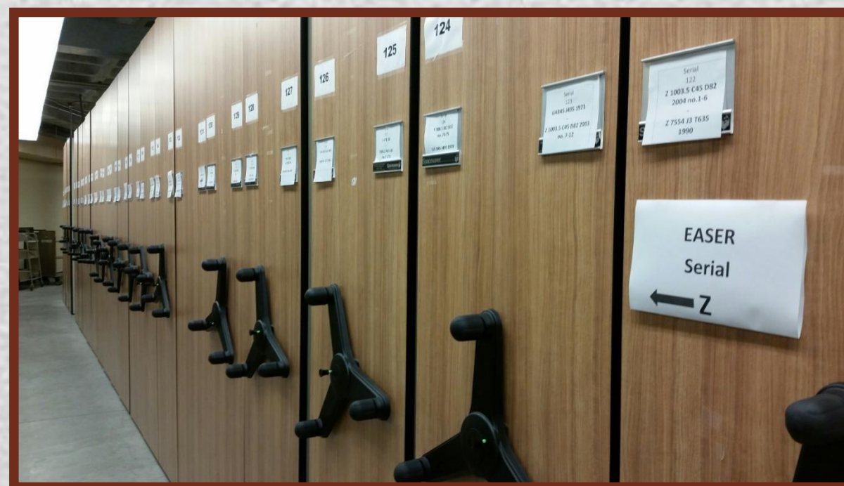
All serials finally consolidated into a single location by call number, the result of a major shifting project to enhance accessibility and preservation, September 2016

In 2016, East Asia Library completed a one-year project to reorganize the Auxiliary Stacks to allow EAL print periodicals to be shelved in one location and to create more shelving space for monographs. This was the most extensive shelving shifting to date at the East Asia Library.