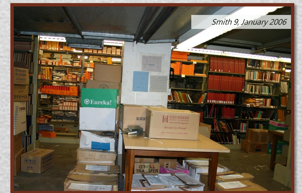
Smith 9, January 2006

Besides the Auxiliary Stacks and the EAL Special Collections Room, the East Asia Library also holds some materials in a storage area (accessible to library staff only) in Smith Hall known as Smith 9 . At present, these are primarily older backlog items awaiting cataloging, older newspaper issues, duplicate books, and various other miscellany. Clean-up efforts over the years have improved organization, and projects like the recent CLIR Chinese Cataloging Project have helped shrink the backlog, cataloging items so they can be moved to the Auxiliary Stacks or the Special Collections Room.